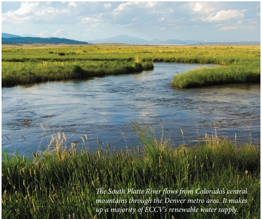
The South Platte River flows from Colorado's central mountains through the Denver metro area. It makes up a majority of ECCV's renewable water supply.

Find information on EPA PFAS standards at https://www.epa.gov/sdwa/and-polyfluoroalkyl-substances-pfas